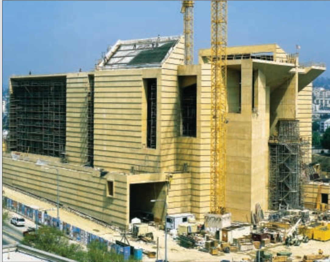
Cathedral of Our Lady of the Angels, Los Angeles, CA

A Great Release with Excellent Benefits!